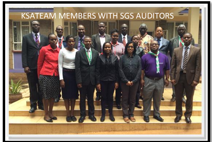
THE ASSOCIATION'S CHIEF SCOUT AND CHIEF COMMISSIONER WITH OTHER KSA MEMBERS DURING THE SGS/GSAT AUDIT