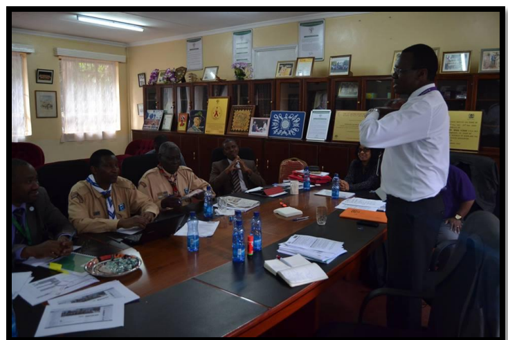
THE ASSOCIATION'S NATIONAL EXECUTIVE COMMISSIONER ADDRESSING KSA MEMBERS AFTER THE SGS/GSAT AUDIT