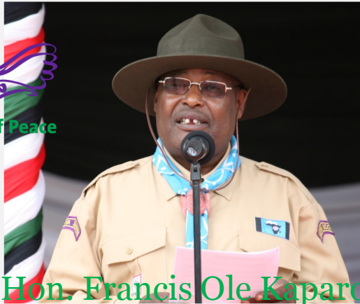
Hon. Francis Ole Kaparo Chief Scout Kenya Scouts