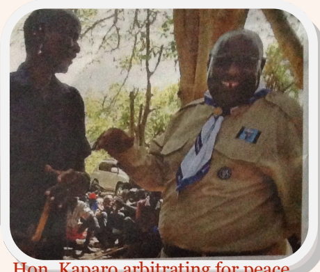
Hon. Kaparo arbitrating for peace in Baringo County

He has lead Scouts in major peace initiatives such as the Marsabit peace caravan which took place from 17 th to 22 nd August 2015, in which young people from various counties in the country transversed the vast Marsabit County advocating for peaceful coexistence among the 14 communities living in this region.