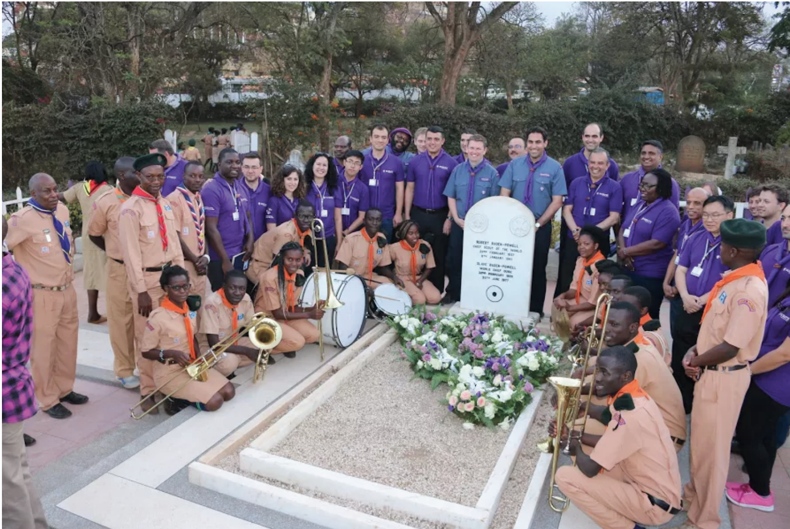
Kisii University Rovers Scouts Band pose for a group photo with with World Scout Committee Members at BP Park, Nyeri.

The World Scout Committee induction workshop and first meeting took place in Nyeri on 5th to 8th October, 2017.