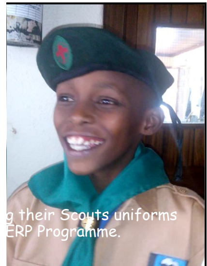
Gleeful Scouts of Aman Children Home after receiving their Scouts uniforms from the Kenya Scouts Association under the ERP Programme.