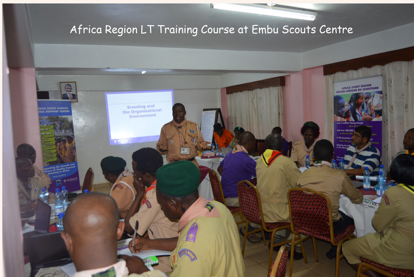
Africa Region LT Training Course at Embu Scouts Centre

Volunteers form the support base the Scout Movement and play an imperative role in it's Management, especially in the implementation of the Youth Program .